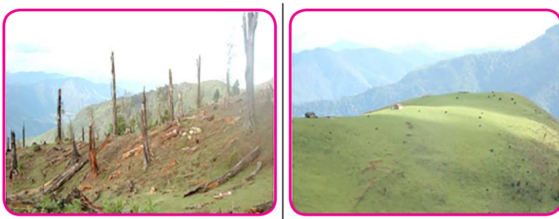
Fig. 3: (a) Forest Converted into Grazing Land, (b)Grazing land. Once it was covered by forest.

growing which ultimately leads to the more forest destruction. Desertification has been widely identified as a major human-induced global change associated with excessive pressure on grasslands (Meyer and Turner, 1992).