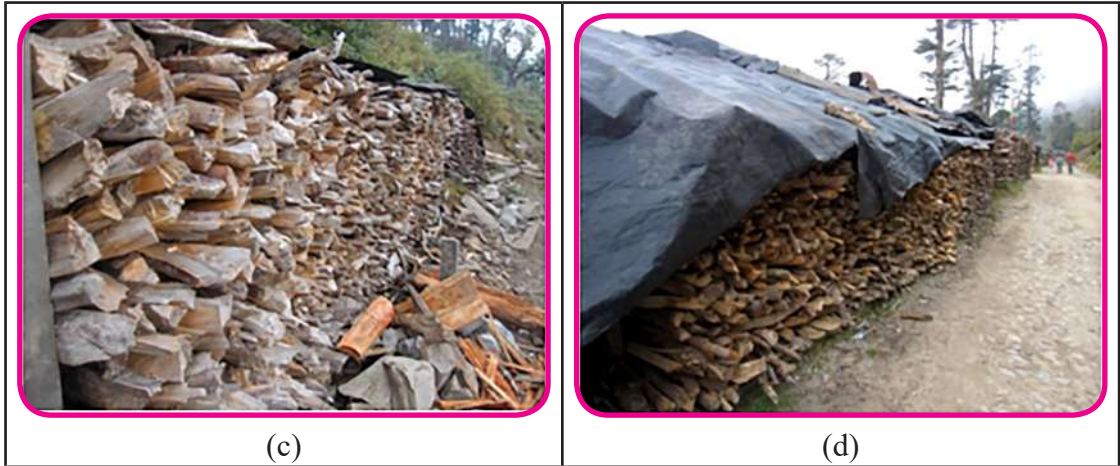
Fig. 1: (a) Destruction of Forest for Firewood (b) Firewood (c) & (d) Firewood for Sale.