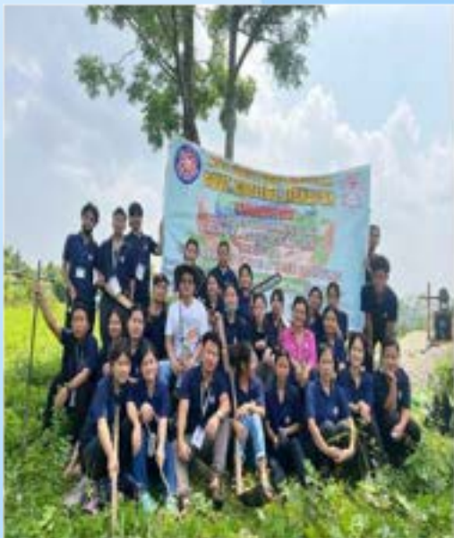
Celebration of World Environment Day by NSS Unit DNGC, Itanagar on 5 th June 2023.