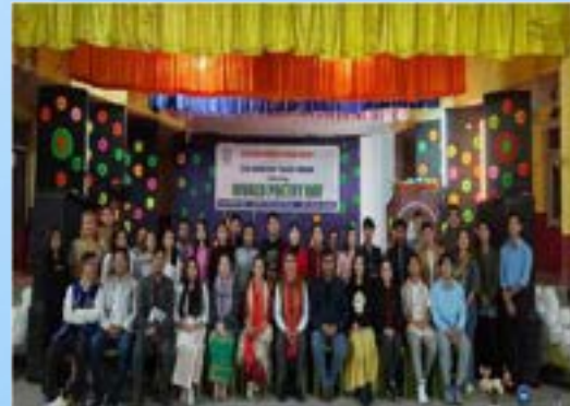
DNGC, Itanagar in collaboration with Arunachal Pradesh Literary Society observed World Poetry Day on 21 st March, 2023 .