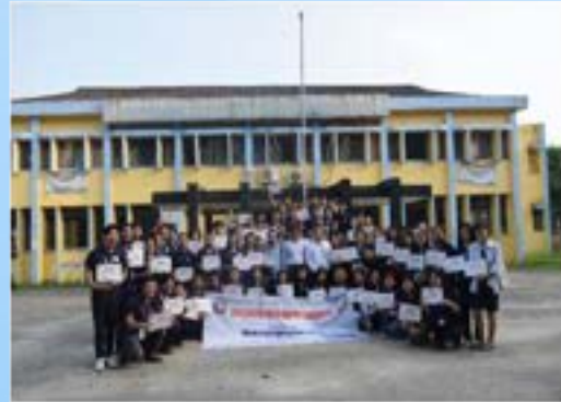
NSS Unit, DNGC Organized Career Counseling and Certificate Distribution Programme on 2 nd June, 2023.