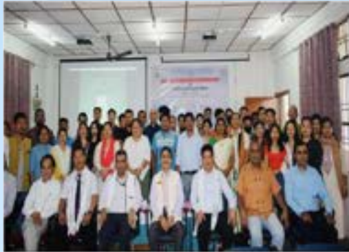
Intellectual Property Rights (IPR) cell, organized “One Day Awareness Workshop on IPR” in collaboration with Patent Information Centre, (APSCS&T) on 4 th May 2023.