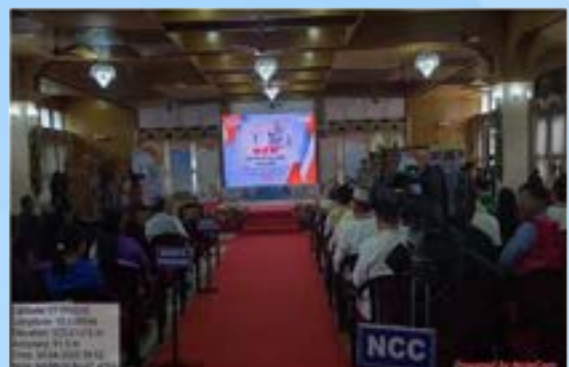
NCC Cadets participating in 100 th episode of "Mann Ki Baat" at Raj Bhawan in Itanagar on 30 th April, 2023.