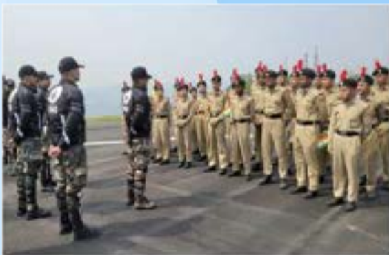
NCC cadets participating in the flag-off ceremony of the Border Roads Organization's (BRO) on 18 th April, 2023.