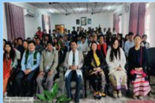
One Day North Eastern Council Workshop on "CAMPUS TO CORPORATE" held on 28 th February, 2023.