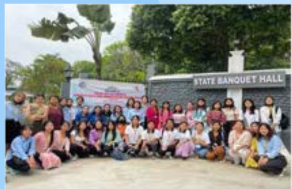
Students attending seminar on "Working of Mahila Thana" organized by Arunachal Pradesh State Commission For Women on 20 th April, 2023.