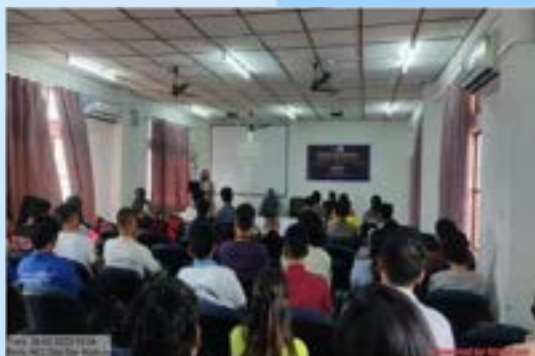
The World Anthropology Day was celebrated by the Department of Anthropology on 16 th February, 2023.