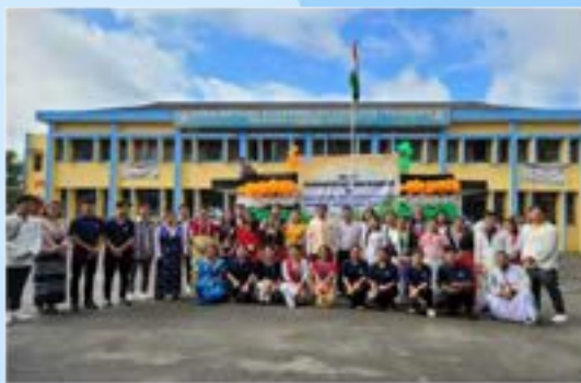
DNGC Itanagar observed 76 th Independence Day on 15 th August, 2022.