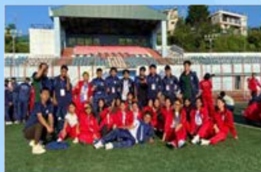
DNGC NSS Volunteers participating in the North East NSS Youth Festival, Mizoram from 4 th to 8 th November, 2022.