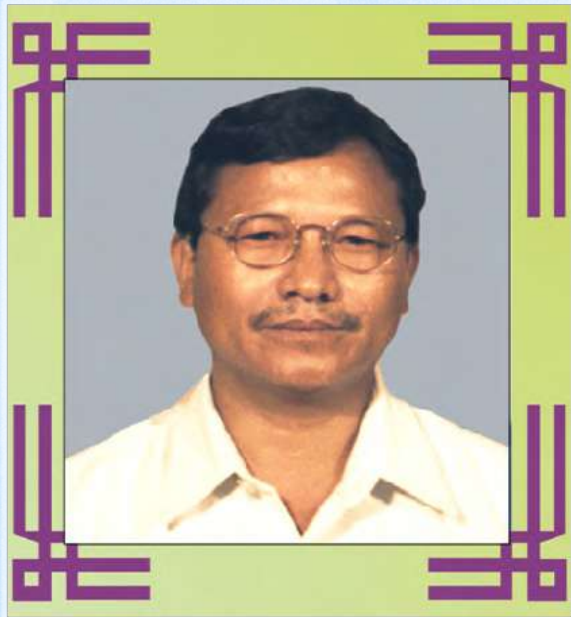
Late Dera Natung Former Education Minister (01/07/1964-08/05/2001)