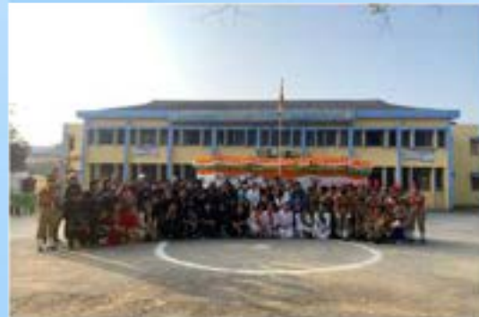
Dera Natung Government College Itanagar celebrated the 74 th Republic Day of India on 26 th January, 2023.