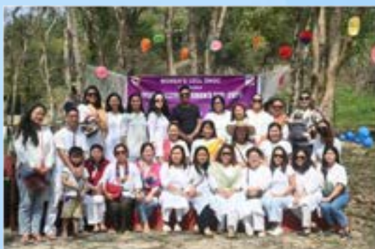
Women's Cell celebrated the International Women Day on 8 th March, 2023.