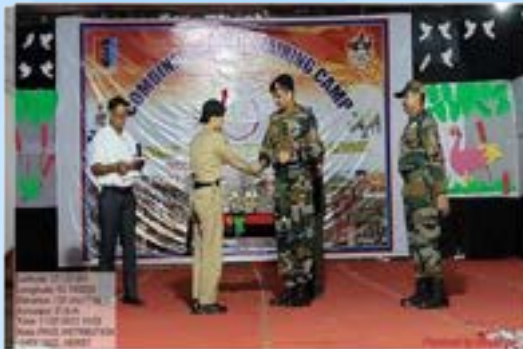
DNGC NCC unit declared overall winner of CATC -22. (Combined Annual Training Camp) held at NERIST from 6 th of July to 12 th July, 2022