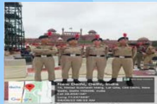
NCC Cadets attended the "Ek Bharat Shresth Bharat- Independence Day camp" held in Delhi from 1 st to 16 th August, 2022.