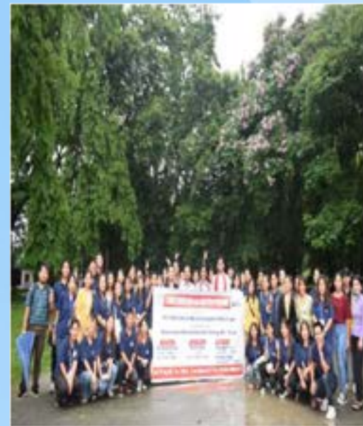
Career Counselling-cum-Induction Programme by National Institute of Electronics & Information Technology (NIELIT) and IQAC, DNGC, Itanagar on 14 th June 2023.