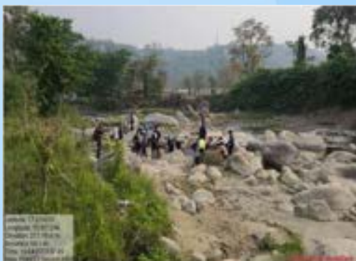
As part of "Puneet Sagar Abhiyan," NCC DNGC cadets cleaned the bank of Sinki River Itnagar on 16 th April, 2023