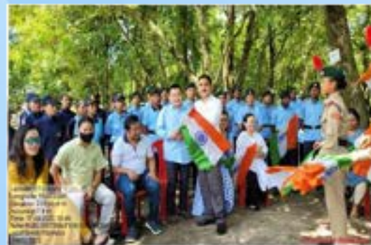
Launch of the Har Ghar Tiranga Campaign, commemorating 75 th years of India's Independence on 11 th August, 2022.