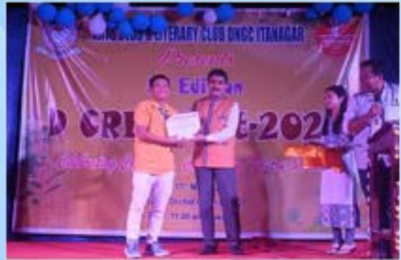
Poetry and Literary activities during D Creo Fest-3 rd edition celebration, on 17 th March, 2023