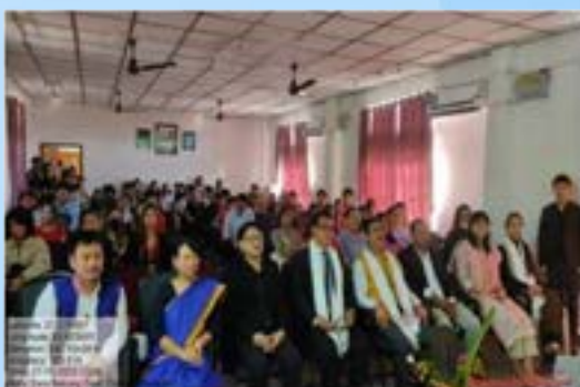
One day workshop on 'Mental Health and Help Seeking Behavior' on 21 st November, 2022.