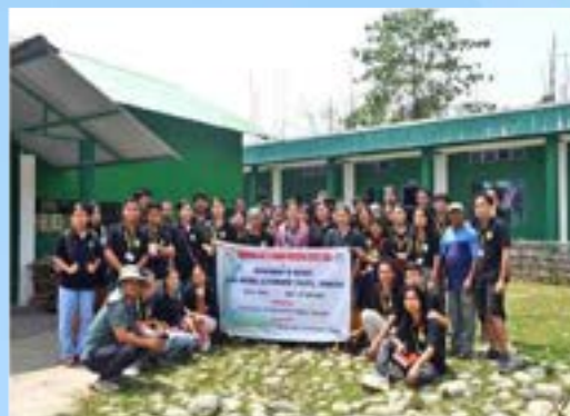
Botany Department organized an educational tour program to Bamboo Processing Centre, Poma on 16 th April, 2023.