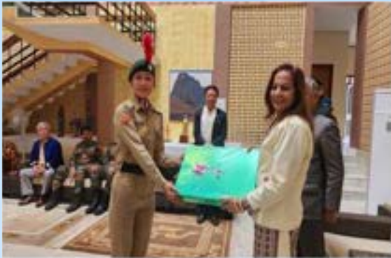
DNGC Cadets felicitated for representing the State in Republic Day Parade in Delhi on 6 th February, 2023.