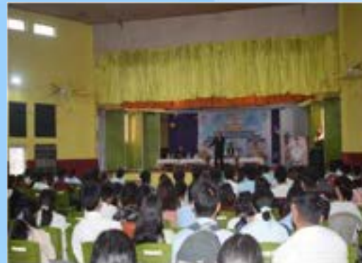
One-day workshop on "Various Career Opportunities" organized by career counselling cell, DNGC on 6 th April, 2023