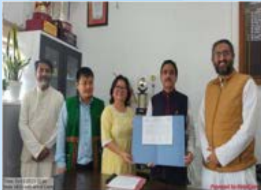
Department of Anthropology signed a Memorandum of Understanding with the Art of Living Arunachal Pradesh on 10 th March, 2023.