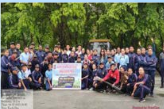
NCC DNGC unit conducted trekking expedition to Dariya Hill to mark Earth Day on 22 nd April, 2023.