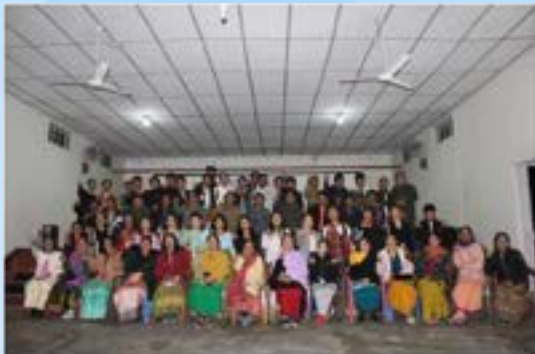
The Department of Anthropology, carried out ethnographic fieldwork at Dipa village on 15 th January, 2023.