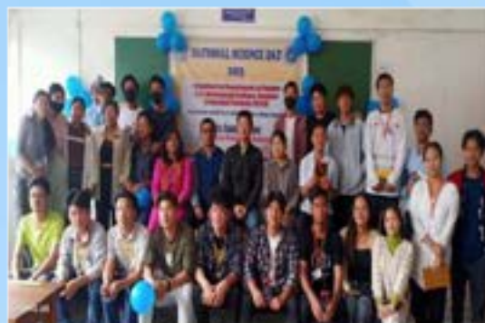
National Science Day observed by the Departments of Physics and Botany on 28 th February, 2023.